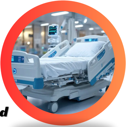
Specially designed bed